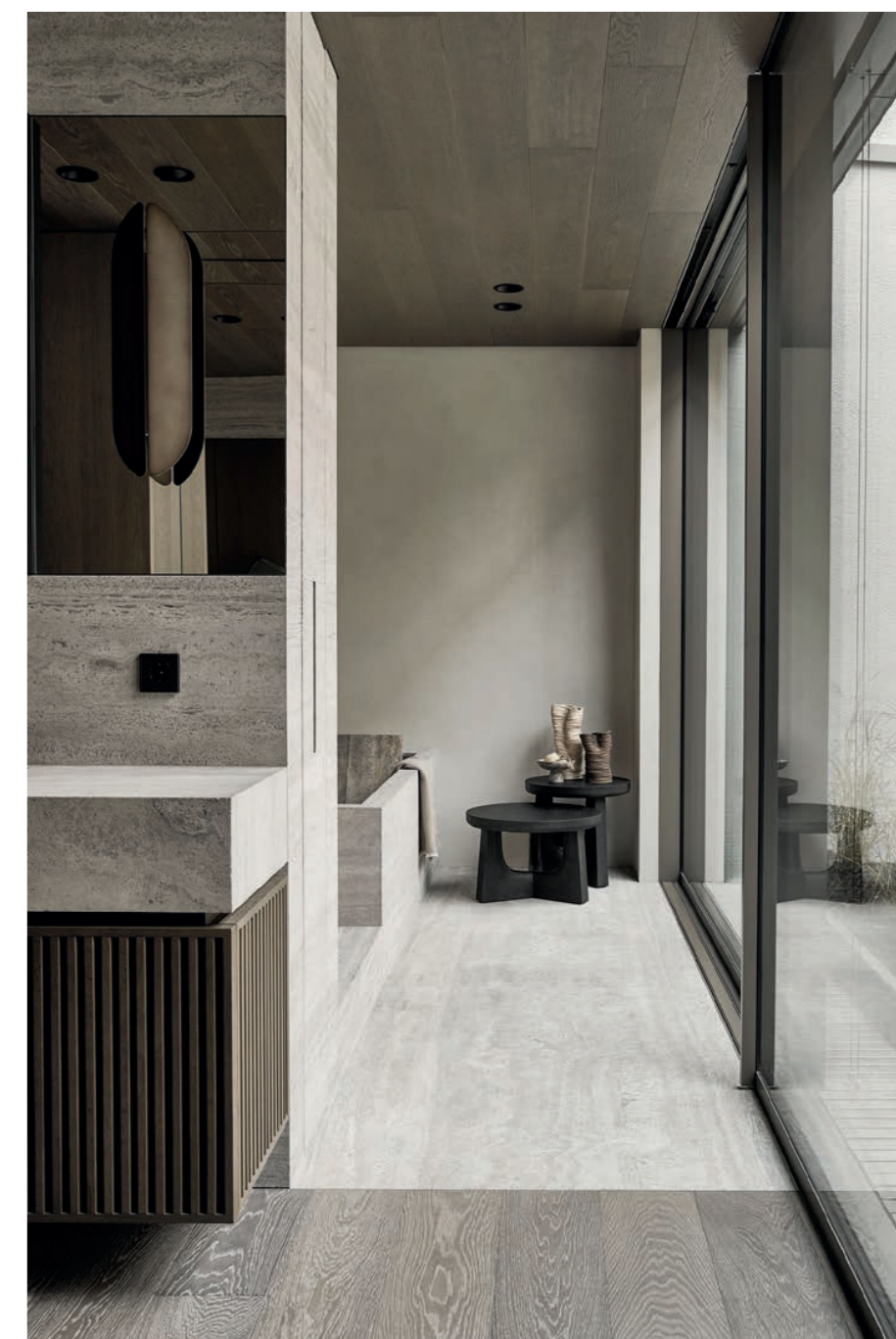
Elaborate natural stonework (in Travertine Silver) makes the bathroom unique.