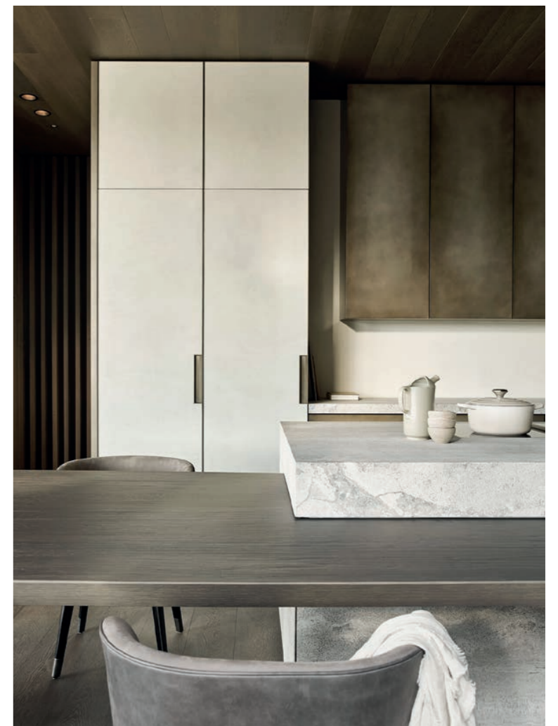
Natural stone, woodwork and accessories are kept in matching natural tones.