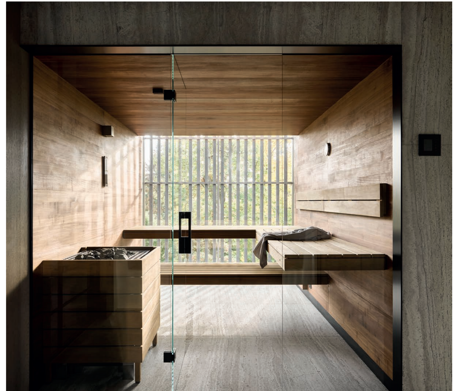
Reduction to what is essential can also be seen in the spa.